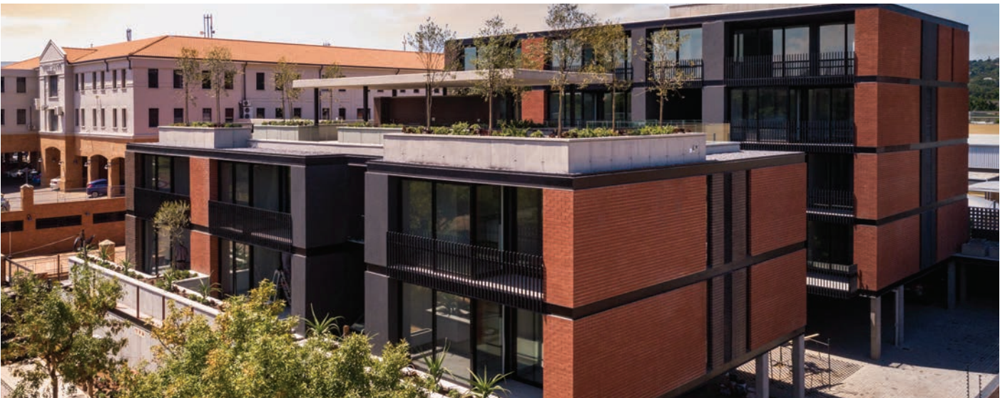
Roundabout Brooklyn | Architect - W Design Architecture Studio

View the range of Special Shaped Bricks | www.corobrik.co.za