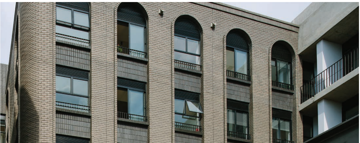
Brooklyn House | Architect - Boogertman + Partners

View the range of Special Shaped Bricks | www.corobrik.co.za