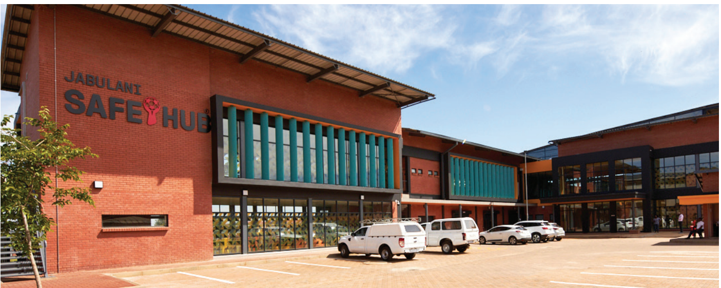
Jabulani Safe-Hub | Architect - Prosite Plan

View the range of Special Shaped Bricks | www.corobrik.co.za