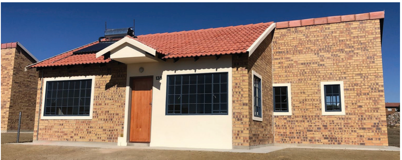
Affordable Housing Development

Download the high-resolution swatches, BIM files and view more project photos | www.corobrik.co.za