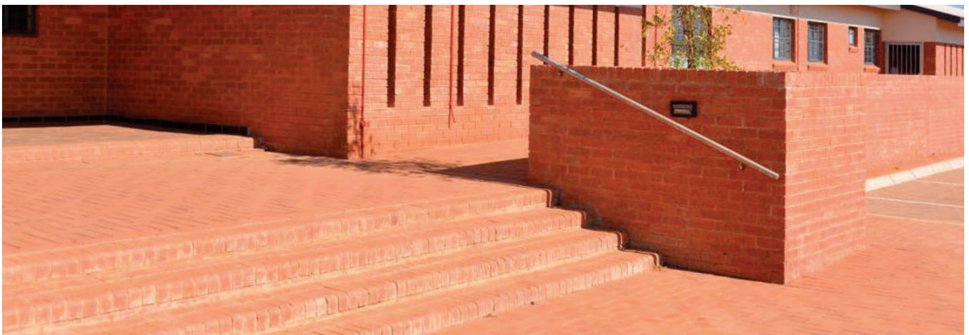
Chief Albert Luthuli Primary School

View the range of Special Shaped Bricks | www.corobrik.co.za