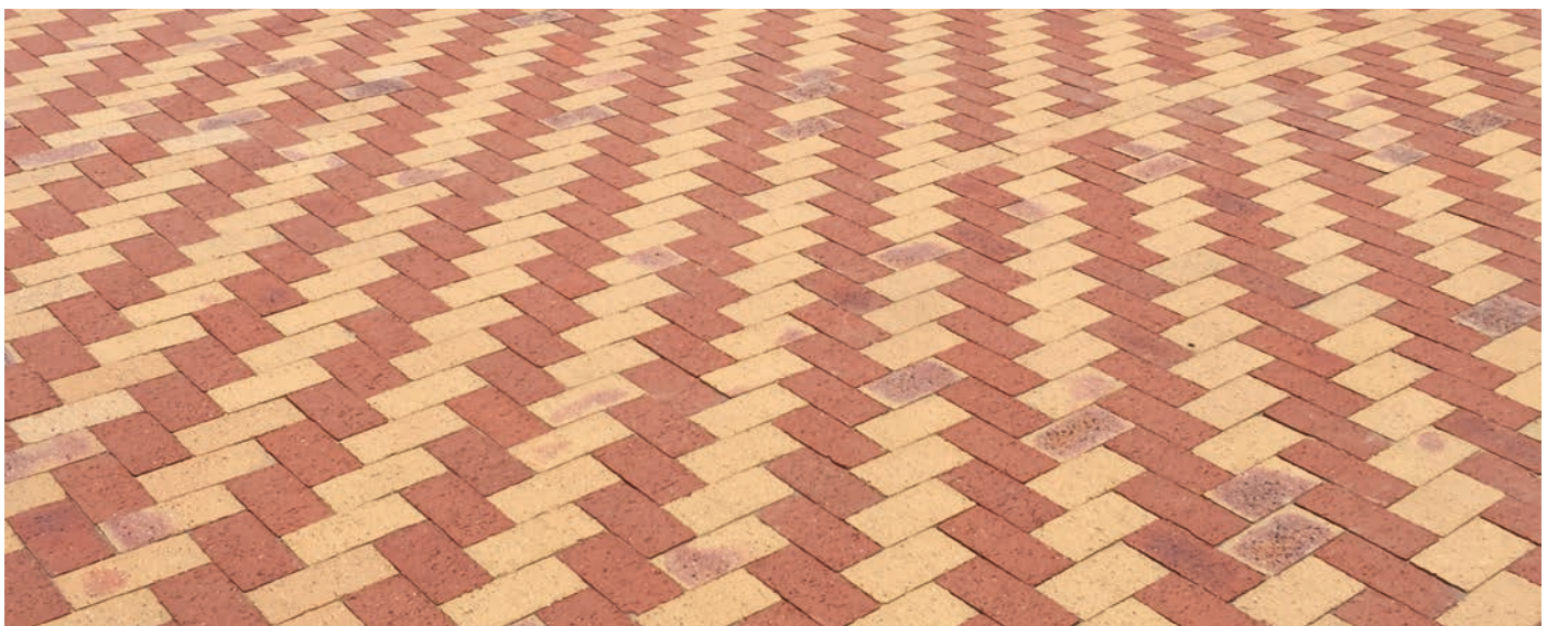
Combination of Namaquastone and Burgundy Modular pavers

Download the high-resolution swatches, BIM files and view more project photos | www.corobrik.co.za