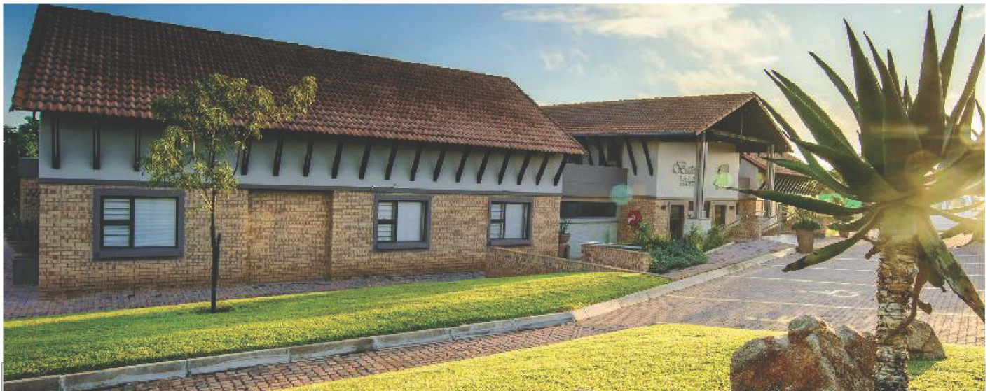
Bateleur Estate, Nelspruit

Download the high-resolution swatches, BIM files and view more project photos | www.corobrik.co.za