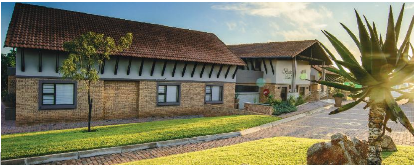
Bateleur Estate, Nelspruit

Download the high-resolution swatches, BIM files and view more project photos | www.corobrik.co.za