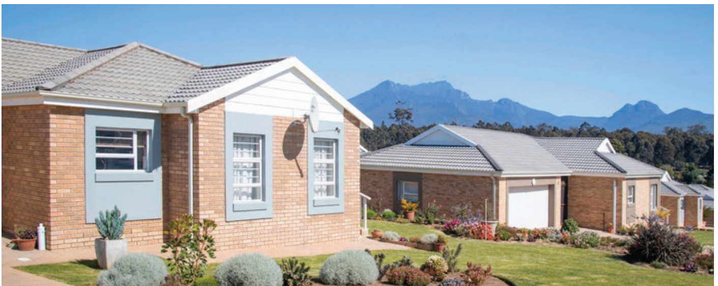
Groenkloof Retirement Village George

View the range of Special Shaped Bricks | www.corobrik.co.za