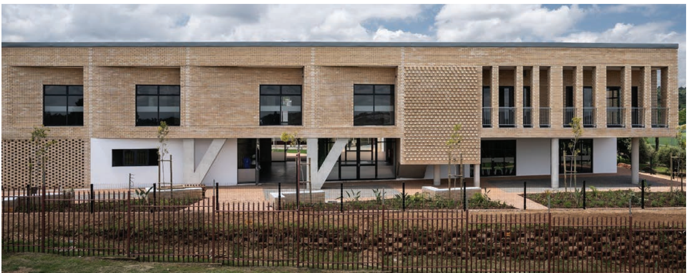
Curro Northriding College High School | Architect – BPAS Architect | Photo credit – 3sixty Photography

View the range of Special Shaped Bricks | www.corobrik.co.za