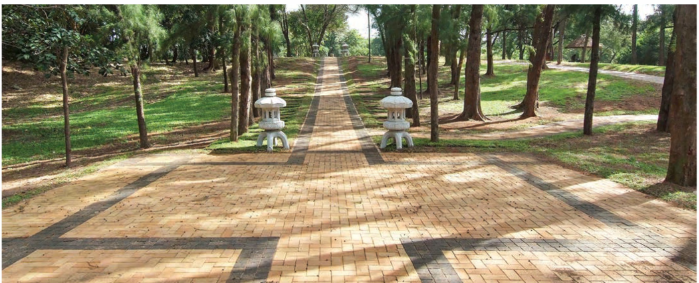
Japanese Gardens | Architect - eThekweni Municipality's Architectural Department

Download the high-resolution swatches, BIM files and view more project photos | www.corobrik.co.za