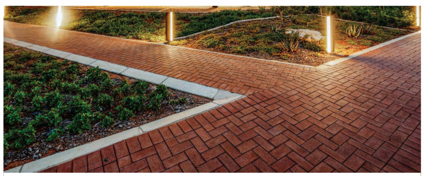
Absa, Ridgeside | Architect - Elphick Proome Architecture

Download the high-resolution swatches, BIM files and view more project photos | www.corobrik.co.za