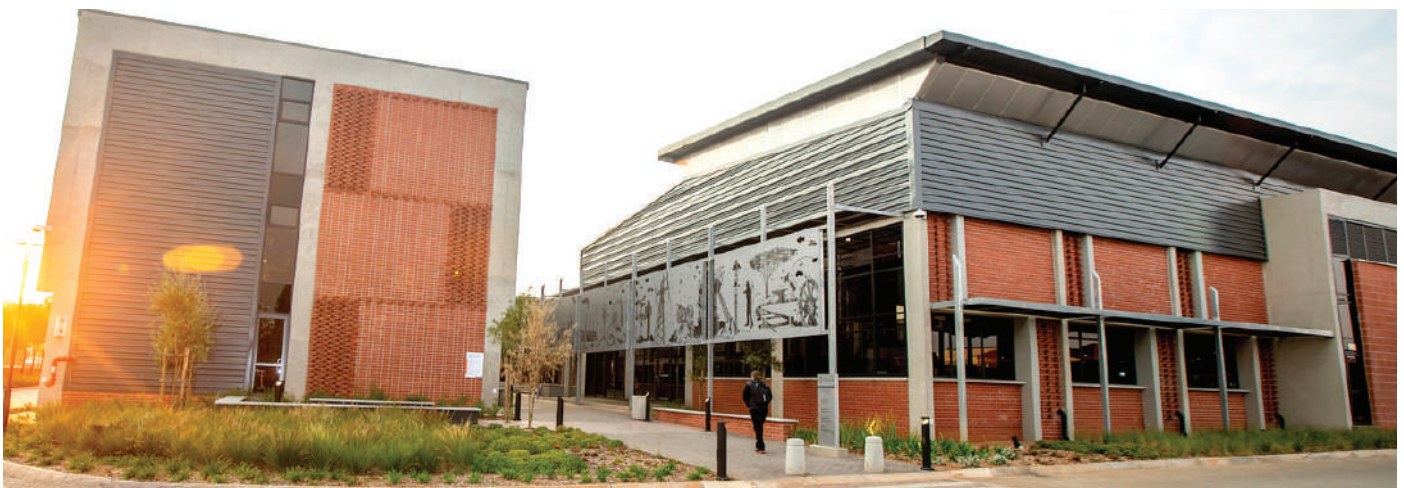
Sol-Tech Campus | Architect - Jeremie Malan Architects

View the range of Special Shaped Bricks | www.corobrik.co.za