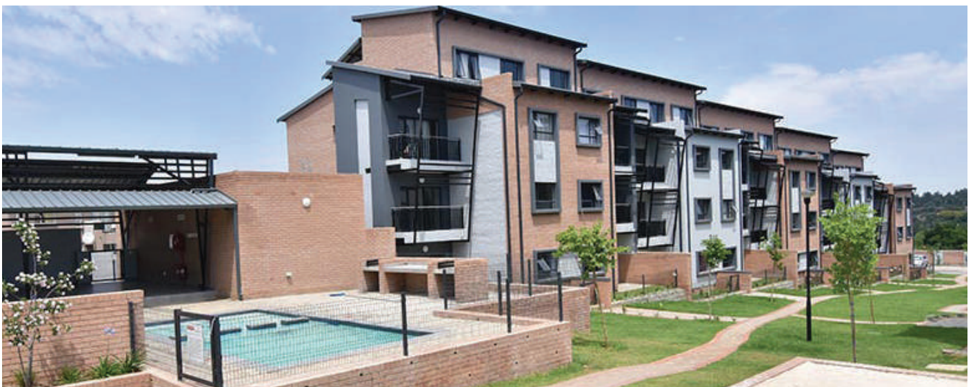
Waterfall Ridge Apartments

View the range of Special Shaped Bricks | www.corobrik.co.za