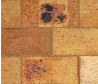
MEADOW PAVER PB 200 x 98.5 x 50mm / 200 x 98.5 x 65mm Available in special shapes Phesantekraal Factory – Western Cape