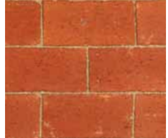
DE HOOP RED PAVER PB 200 x 98.5 x 50mm / 200 x 98.5 x 73mm Available in special shapes De Hoop Factory – Western Cape