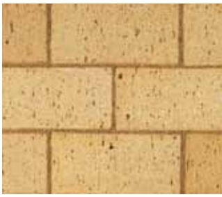
CHAMPAGNE PAVER PA (SABS 1575:2007) (ISO 9001:2008) 220 x 108.5 x 50mm/200 x 98.5 x 65mm (Chamfered and Nibbed). Available in special shapes and bullnose. Springs Factory – Gauteng