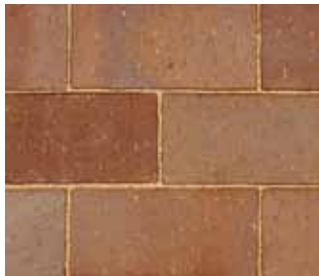
NUTMEG PAVER PA (SABS 1575:2007) (ISO 9001:2008) 220 x 108.5 x 50mm/200 x 98.5 x 65mm (Chamfered and Nibbed). Available in special shapes and bullnose. Springs Factory – Gauteng