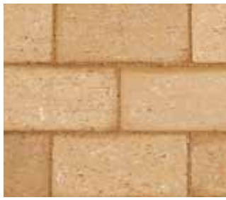
NATURAL EARTH PAVER PB 200 x 98.5 x 65mm Available in special shapes Phesantekraal Factory – Western Cape