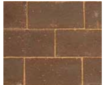
DE HOOP MATT BROWN PAVER PB 200 x 98.5 x 50mm/200 x 98.5 x 73mm Available in special shapes De Hoop Factory – Western Cape