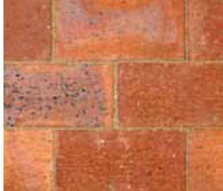
CONSTANTIA PAVER PB 200 x 98.5 x 50mm / 200 x 98.5 x 65mm Available in special shapes Phesantekraal Factory – Western Cape