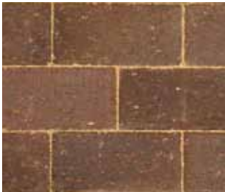
CAPE STORMBERG PAVER PB 200 x 98.5 x 65mm Available in special shapes Phesantekraal Factory – Western Cape