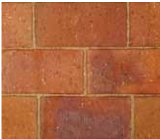
TUSCAN BLEND PAVER PA (SABS 1575:2007) (ISO 9001:2008) 220 x 108.5 x 50mm/200 x 98.5 x 65mm (Chamfered and Nibbed). Available in special shapes and bullnose. Springs Factory – Gauteng