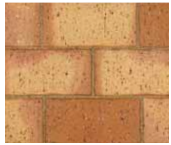
CEDERBERG PAVER PA (SABS 1575:2007) (ISO 9001:2008) 220 x 108.5 x 50mm/200 x 98.5 x 65mm (Chamfered and Nibbed). Available in special shapes and bullnose. Springs Factory – Gauteng