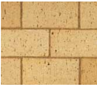
CHAMPAGNE PAVER PA (SABS 1575:2007) 220 x 108.5 x 50mm/200 x 98.5 x 65mm (Chamfered and Nibbed). Available in special shapes and bullnose. Springs Factory – Gauteng