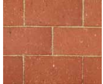
BURGUNDY PAVER PA (SABS 1575:2007) 220 x 108.5 x 50mm/200 x 98.5 x 65mm (Chamfered and Nibbed). Available in special shapes and bullnose. Springs Factory – Gauteng