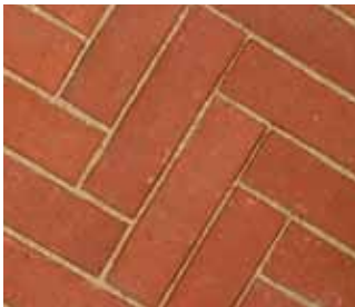
BURGUNDY PIAZZA PAVER PA 210 x 60 x 60mm (Chamfered) Springs Factory – Gauteng