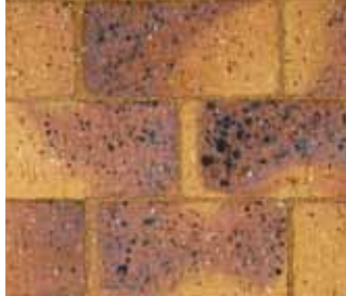
NAMAQUASTONE PAVER PB 220 x 108.5 x 50mm (Nibbed) Springs Factory – Gauteng