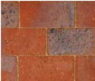
IRONSTONE PAVER PB 220 x 108.5 x 50mm (Nibbed) Springs Factory – Gauteng