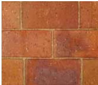
TUSCAN BLEND PAVER PA (SABS 1575:2007) 220 x 108.5 x 50mm/200 x 98.5 x 65mm (Chamfered and Nibbed). Available in special shapes and bullnose. Springs Factory – Gauteng