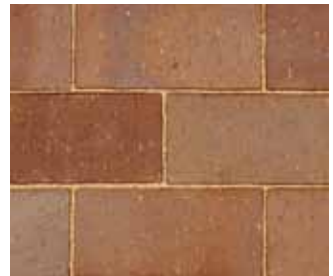
NUTMEG PAVER PA (SABS 1575:2007) 220 x 108.5 x 50mm/200 x 98.5 x 65mm (Chamfered and Nibbed). Available in special shapes and bullnose. Springs Factory – Gauteng