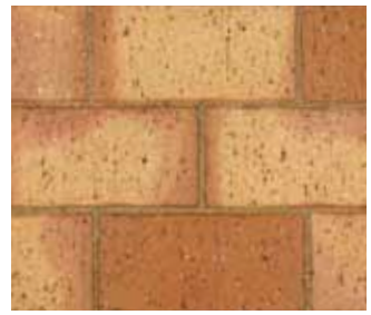
CEDERBERG PAVER PA (SABS 1575:2007) 220 x 108.5 x 50mm/200 x 98.5 x 65mm (Chamfered and Nibbed). Available in special shapes and bullnose. Springs Factory – Gauteng